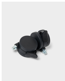
Wheels w/ brake